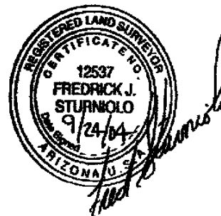
Exhibit "A" Page 2

ABOVE DESCRIBED PARCEL OF LAND CONTAINS 43.92 ACRES OF LAND, MORE OR LESS.